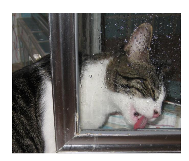
A fat cat can lap.