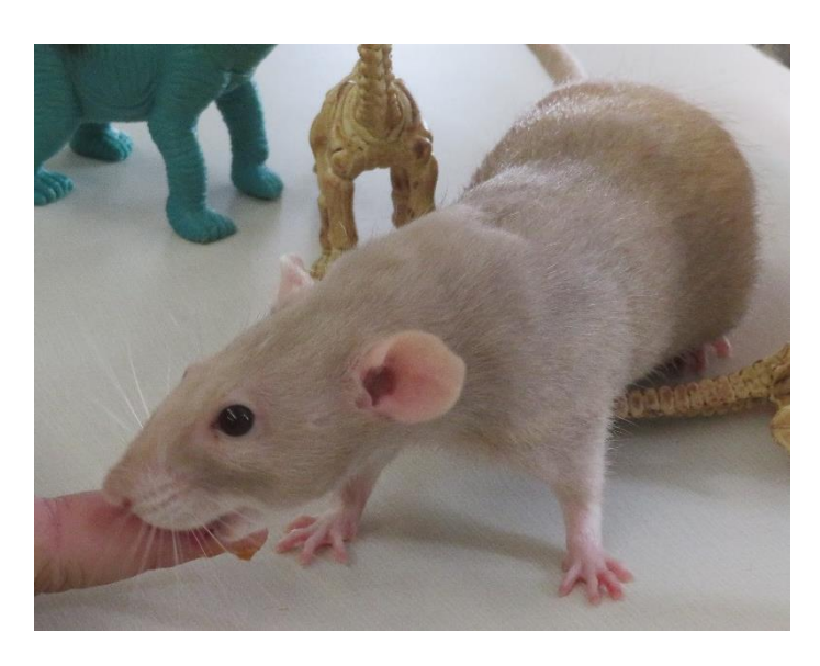
A fat rat can lap.