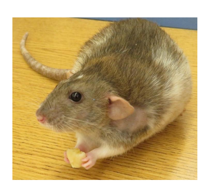
A fat rat sat on a mat.