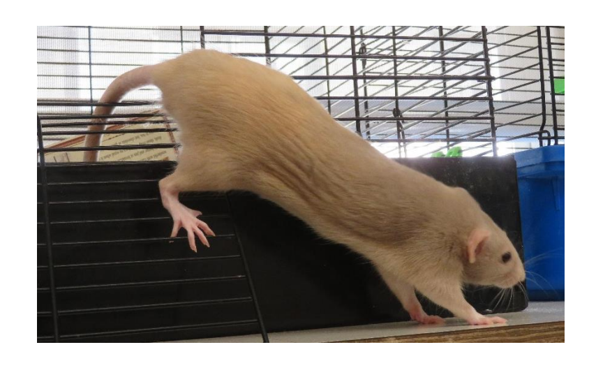
Rat ran. Cat ran. A cat can nab a rat. Sad rat!