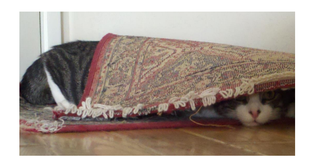
A fat cat sat on a mat.